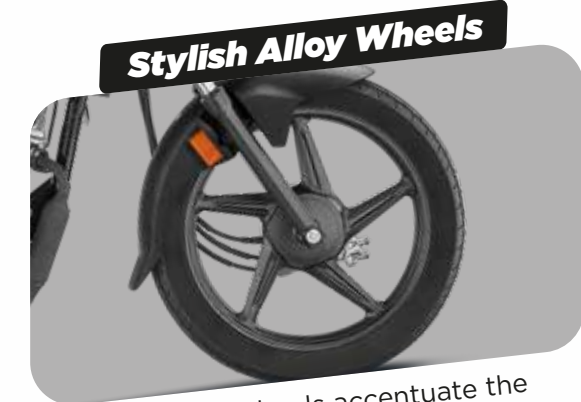
Stylish Alloy Wheels All-black alloy wheels accentuate the overall look of the bike.